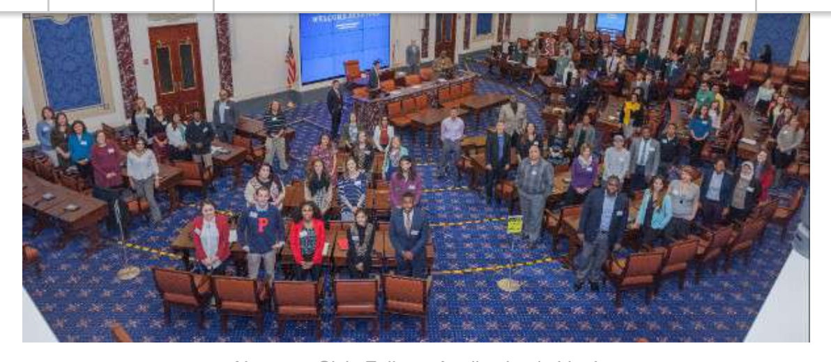
Newman Civic Fellows Application is Live! <u>Campus Compact's</u> signature student leadership initiative has opened submissions for 2018 applications. Campus deadline to submit a Newman Civic Fellows nomination: February 1, 2018. <u>More information here!</u>