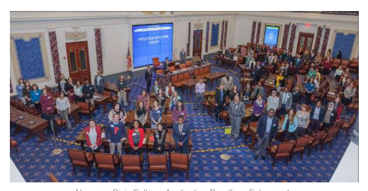
Newman Civic Fellows Application Deadline: February 1. <u>Campus Compact's</u> signature student leadership initiative has opened submissions for 2018 applications. Campus deadline to submit a Newman Civic Fellows nomination: February 1, 2018. <u>More information here!</u>

MTCC works with its friends at <u>Reach Higher Montana</u> and <u>Serve Montana</u> to offer scholarships to community-engaged incoming (fall of 2018) college freshmen. The Youth Serve Montana Scholarship offers $1000 to 100 Montana students who have served at least 100 volunteer hours in the past year. Applications are due January 31, 2018. <u>More information here!</u>