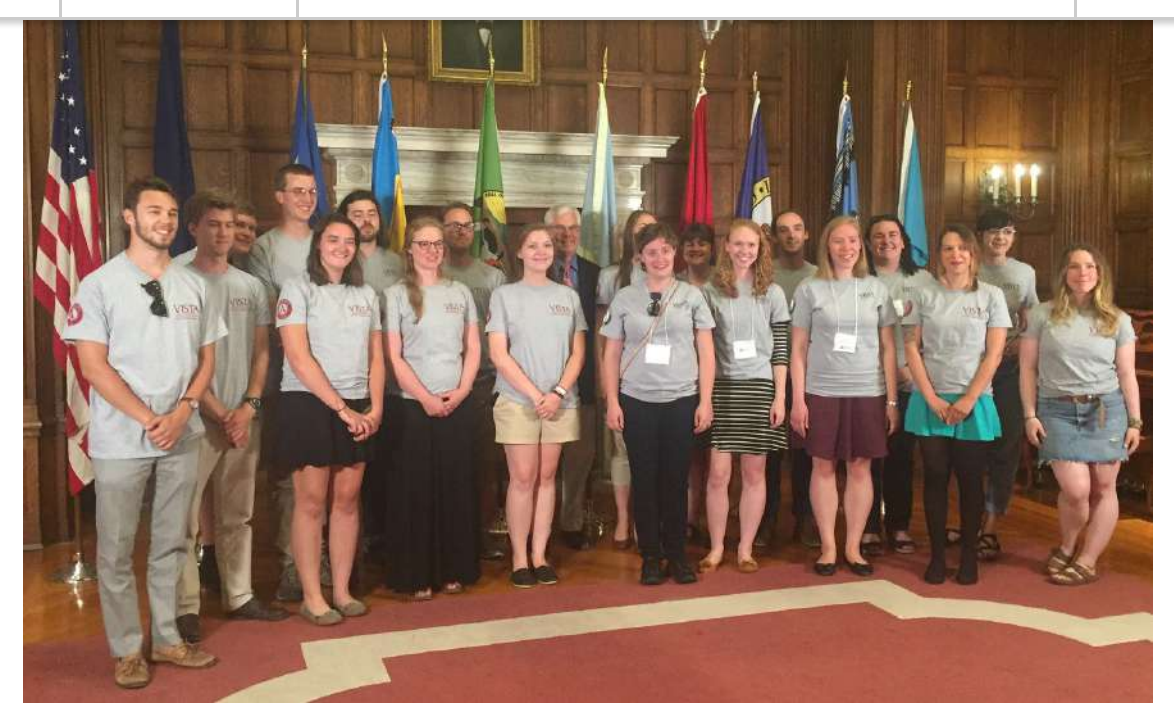
Thank you for your service MTCC AmeriCorps VISTAs! This month the July 2017 cohort of MTCC VISTAs completed their service. The amazing service members supported antipoverty work in Poplar, Pablo, Bozeman, Hamilton, Kalispell, Butte, Missoula, Troy and beyond. Thank you for your gift of a year of your life in service, living at the poverty level and building sustainable programs to address and reduce poverty.