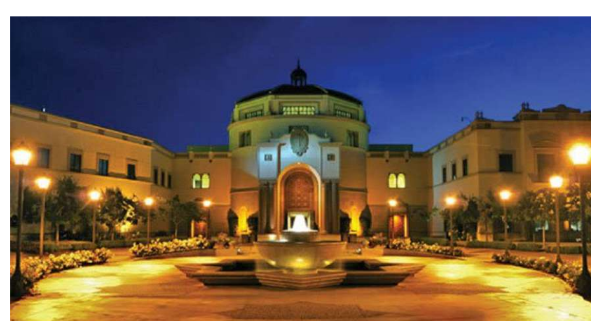
Western Region Campus Compact's 2019 <u>Continuums of Service Conference</u> will happen at the University of San Diego March 6-8, 2019. The conference theme is "Beyond Borders: Embracing Multiple Ways of Knowing and Being." Stay tuned for additional details!

across the state. When people fill out and submit the online survey, the information goes to the Montana Campus Compact network office where responses will be analyzed and individual campus reports created. For questions or more information please contact vernon@mtcompact.org