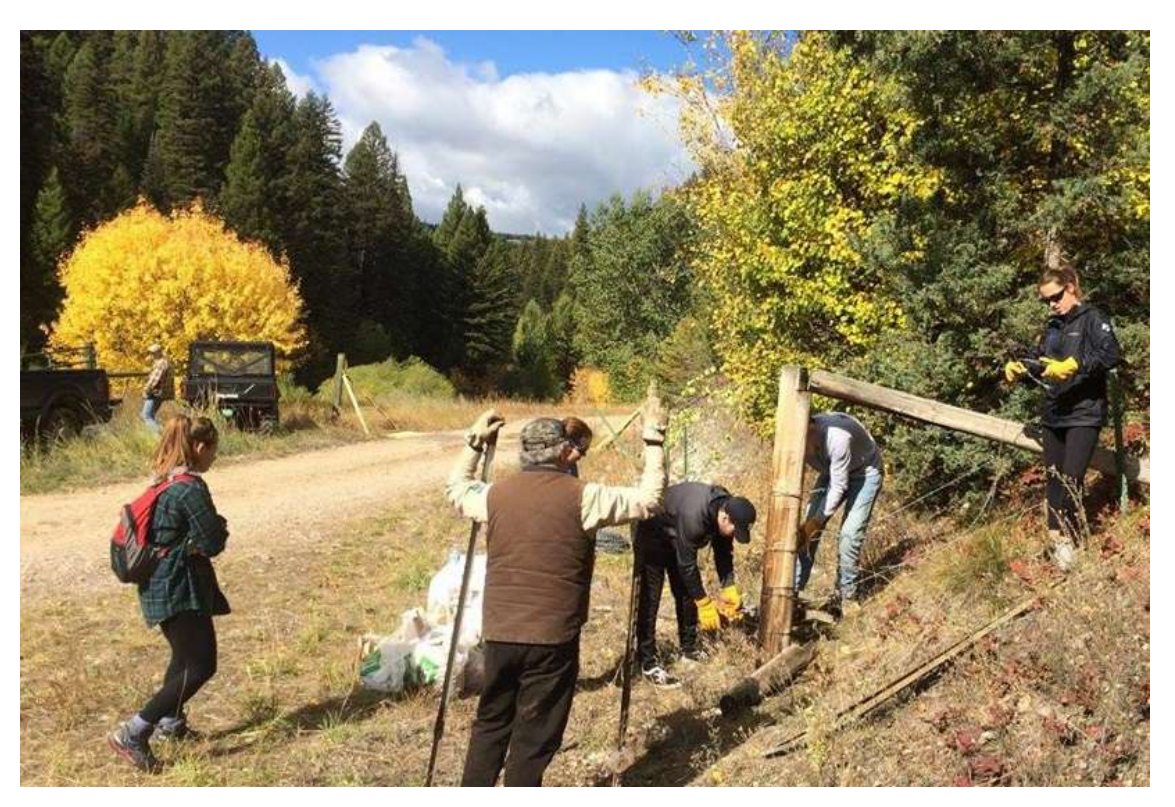
Montana College Students Serve Over 200,000 hours in 2016-17! <u>New MTCC Impact Report</u> highlights impact of higher education on community needs in Montana.