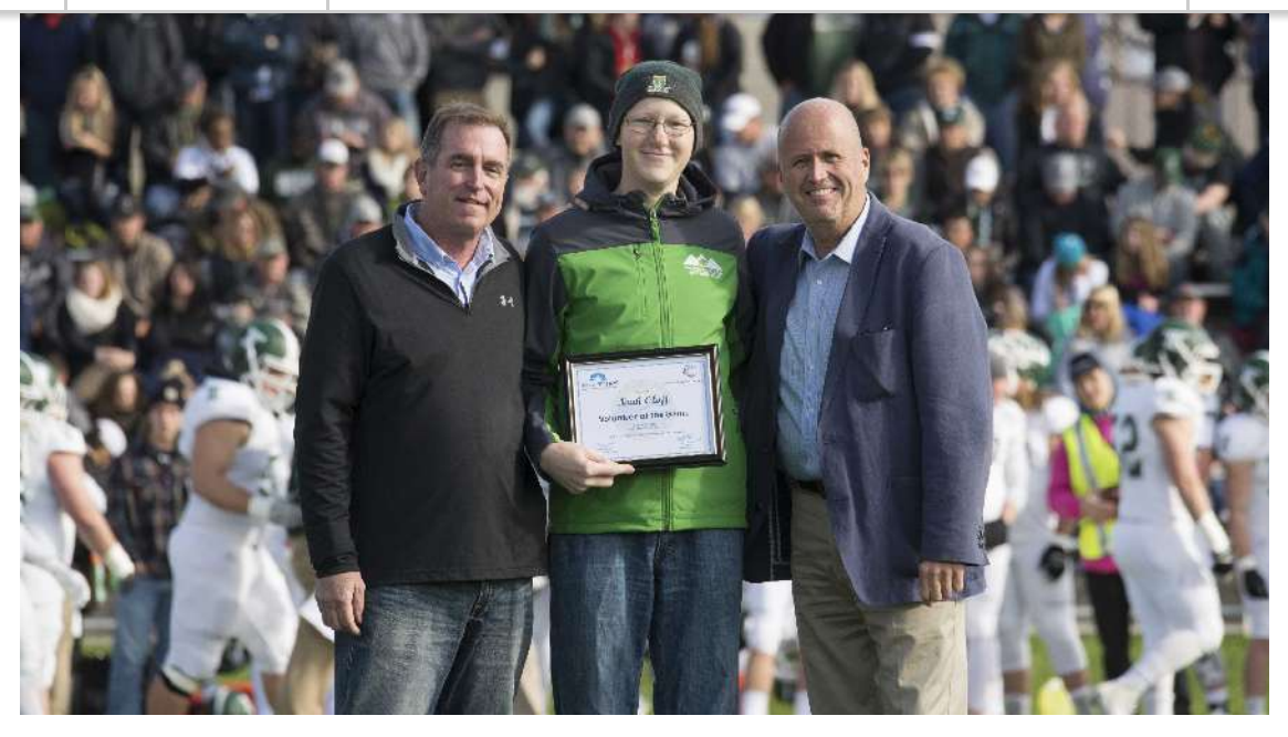
Campuses Set to Honor Student Volunteers The <u>Volunteer of the Game</u> initiative kicks of October 14th in Havre, and lasts through November 4th in Helena.