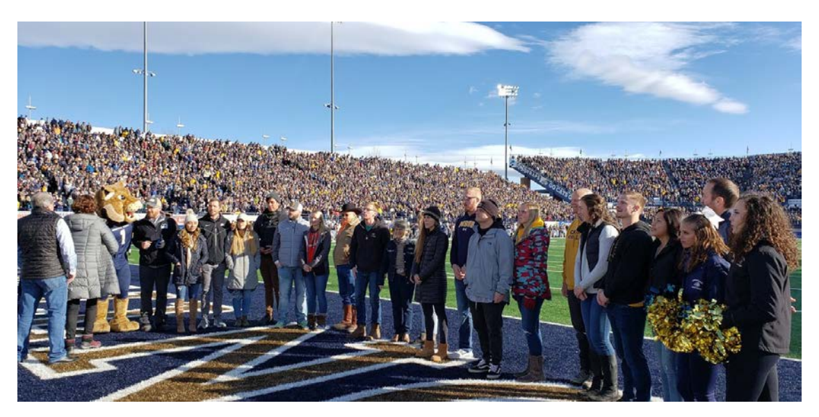
Student Athlete Volunteers Honored at Brawl of the Wild

Fourteen MTCC Student Athlete Volunteers were honored during the Brawl of the Wild November 23rd at Montana State University.