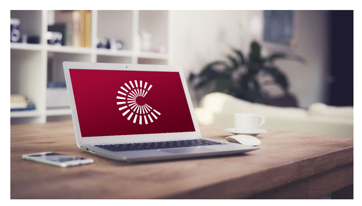
Our National Webinar Series: Pertinent, Thoughtful and Free!

Campus Compact's National Webinar series has returned for AY 2019-2020 with more to support and inspire you. Topics touch on issues of relevance to faculty, staff, students, and their partners in education and community building. Be sure to tune in to each session for information, tools, and resources to help you in your work. These webinars are being offered free of charge, but all participants must register in advance to receive an access link.