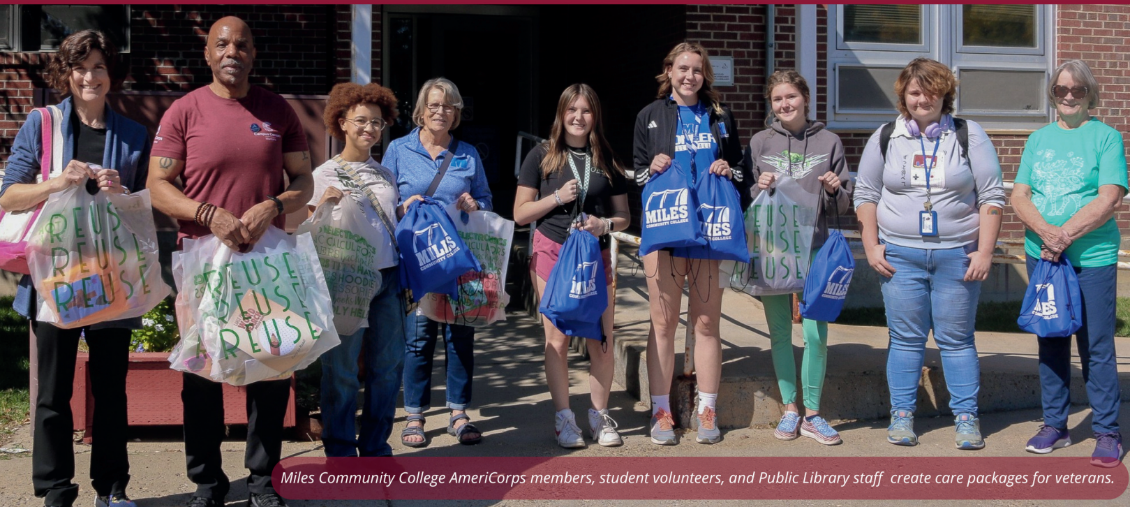
Miles Community College AmeriCorps members, student volunteers, and Public Library staff create care packages for veterans.